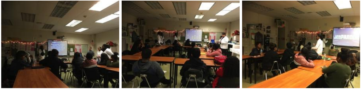
Pictured: Health Science students participate in “Nutrition Jeopardy.”

The medical students share their knowledge and expertise with all of the students in the Dynamics of Health Care in Society Classes. The medical students will be back at the end of the month to share a lesson the prevention of bacterial infections. In February, a field trip is planned to the medical school to participate in hands on activities in the laboratories of the medical school.