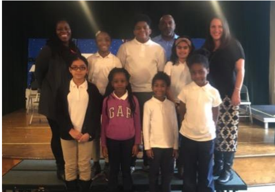
Pictured: OACS Spelling Bee winners with judges.