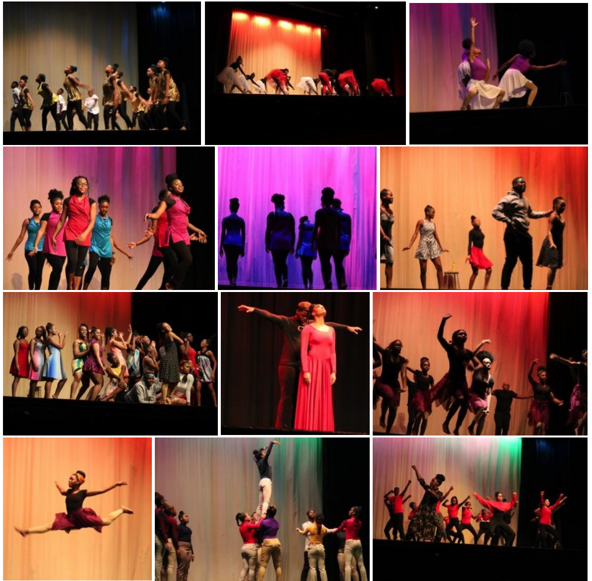
Pictured: Scenes from Rise Up and Dance on January 17.