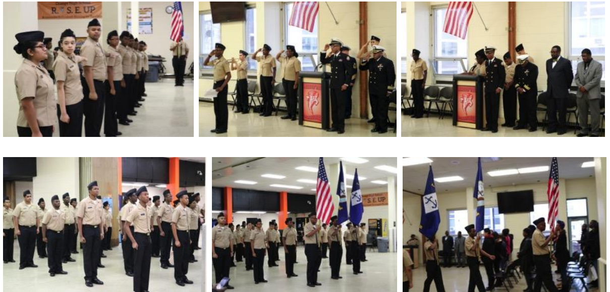
Pictured: Orange NJROTC First Annual Military Inspection ceremony.