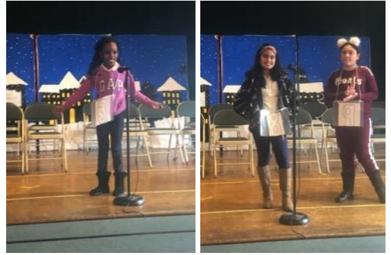
Pictured: OACS Spelling Bee participants.

The top spelling bee scholars will move onto the district-wide spelling bee scheduled for Saturday, March 16.